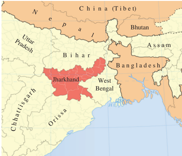
Figure 1: Jharkhand and its neighbors. 1

Sadri has an array of alternate names, above all Sadani , which is the term generally used outside of India to refer to this language; however I will refer to it here exclusively as Sadri , as this is the preferred term in the region itself. 2 According to the Ethnologue, Sadri is spoken by 3,291,180 people (Lewis et al. 2014). Its closest linguistic relative, Bhojpuri, of which Sadri has often been considered a dialect, is spoken primarily to the northwest of Jharkhand by 39,716,000 people (Lewis et al. 2014).