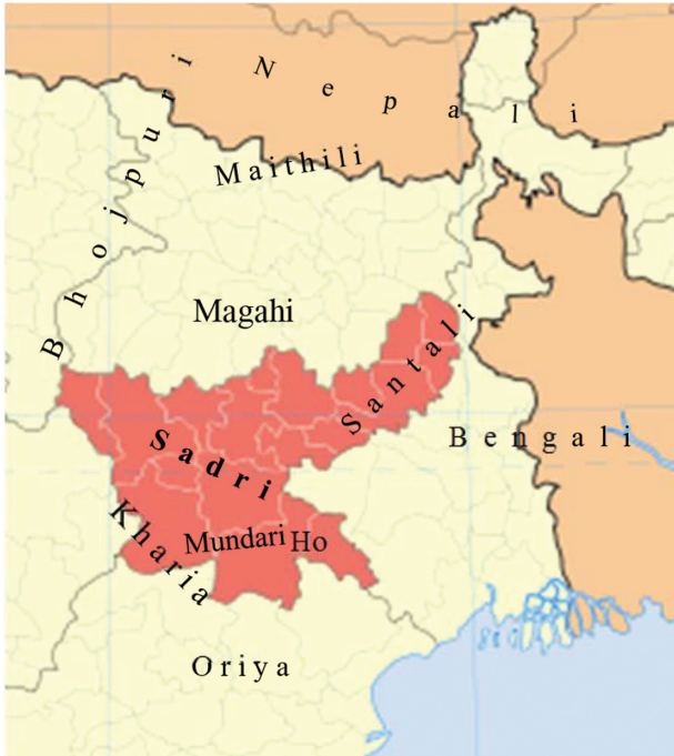
Figure 2: The major languages of eastern-central South Asia and their relative positions (simplified). 4